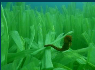
Environmentally friendly (artificial seaweed habitat for fish)